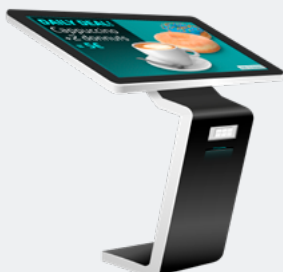
PULSE POS COSTUMER DISPLAY